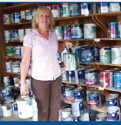
Fulton County Scalehouse Operator, checking in paint