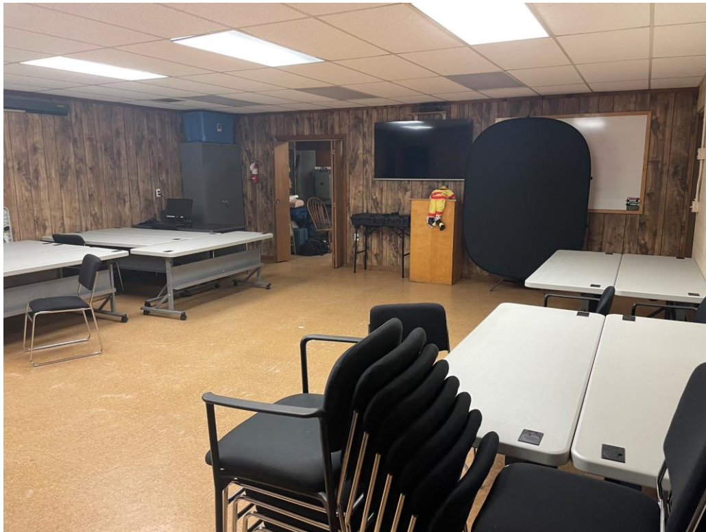
Training Room now: 172 Center Street