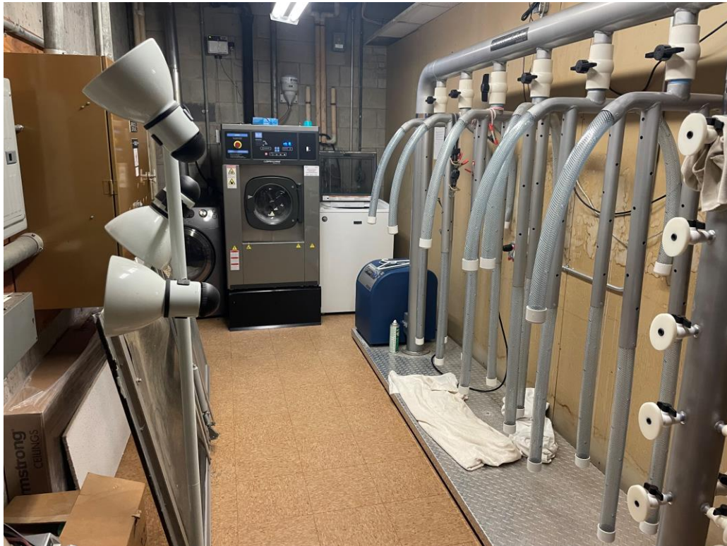
Laundry Area now: 172 Center Street