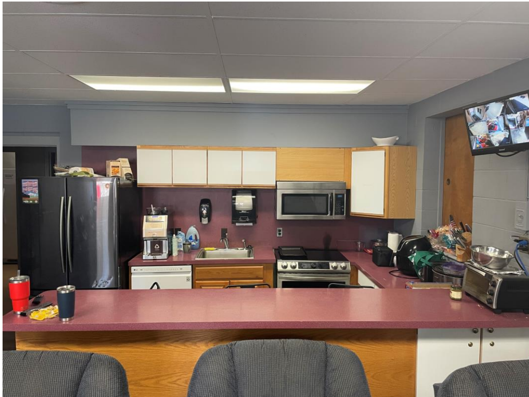
Kitchen Area now: 172 Center Street