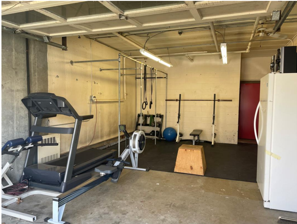
Fitness Area now: 172 Center Street