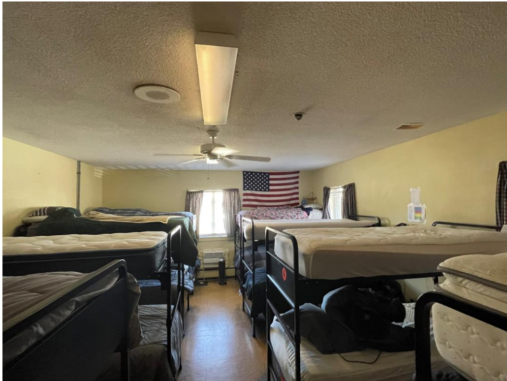
Bunk Room now: 172 Center St