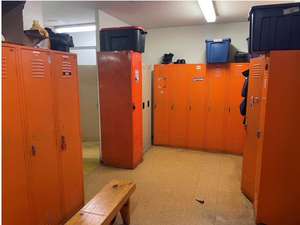
Locker Room now: 172 Center Street