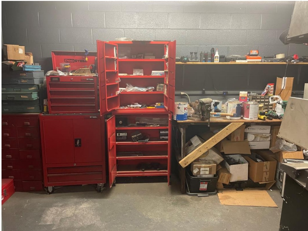
Equipment Maintenance now