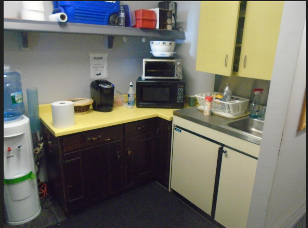
Station Kitchenette at Rear Door