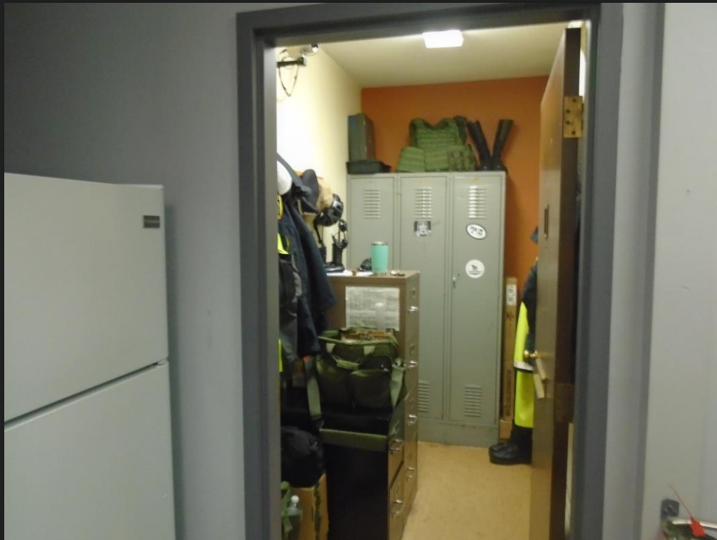
SWAT Room – 3 SEMLEC Team Members

Every usable space is in service. SWAT members must secure their protective gear and weapons as well as their training materials. SWAT members are also the Department Firearms Instructors and Armorers.