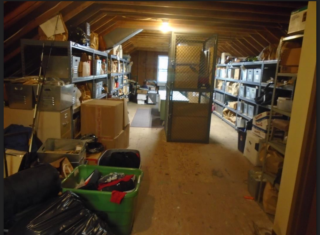
Attic – Property Storage (unheated)