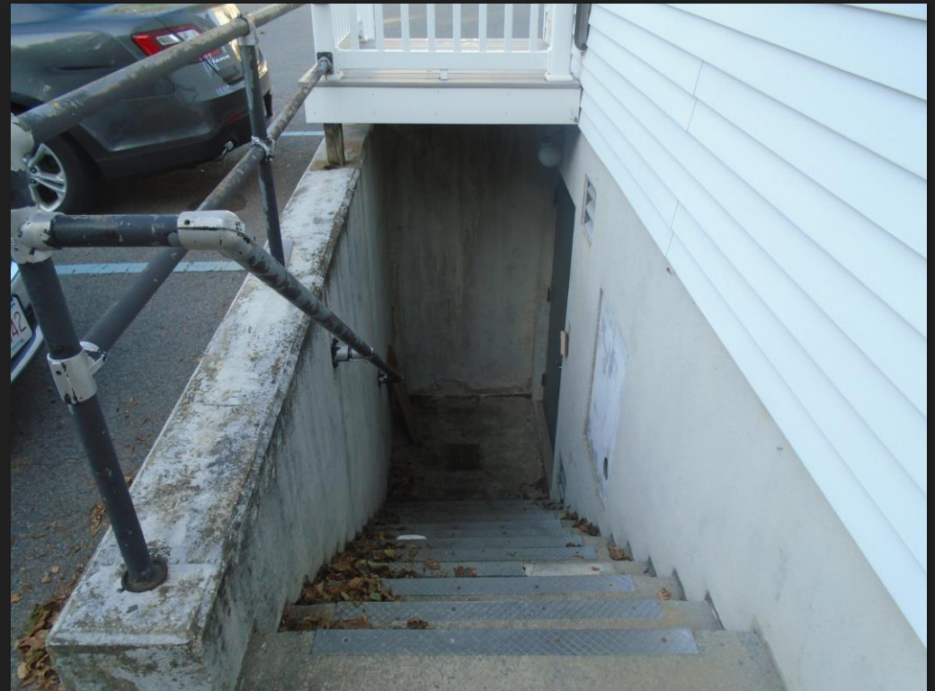
Employee Entrance to Locker Room