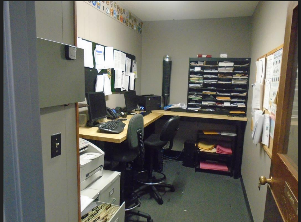
Report Writing Room