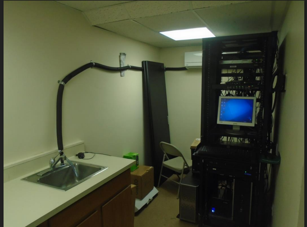
Department Server (formerly PEMA shelter)