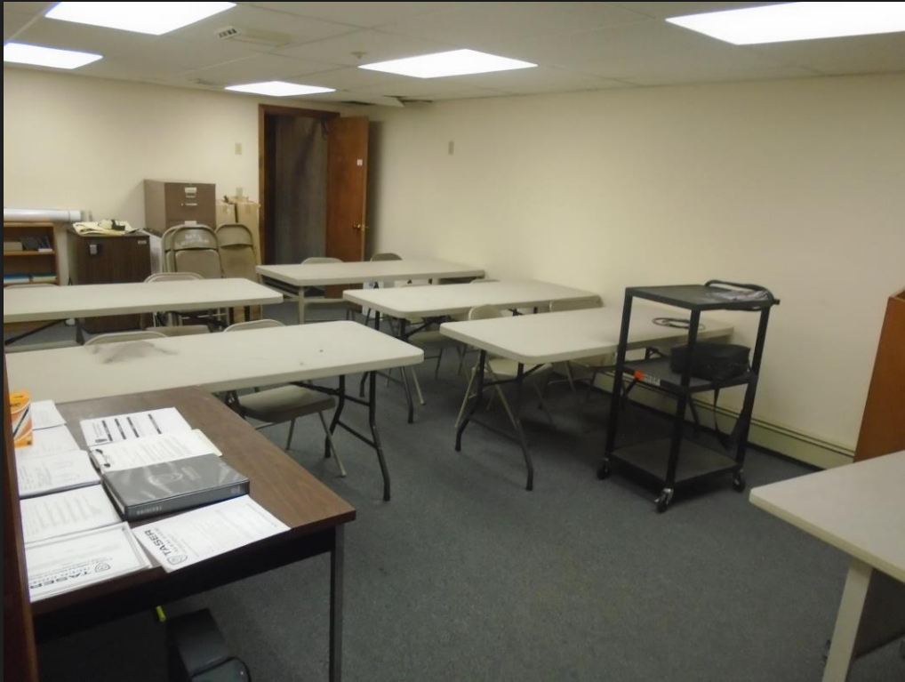
Training Room (formerly PEMA shelter)

In the 1980's parts of the basement were built out to create the Pembroke Emergency Management Operations Center. This area includes a small office, radio room, and a shelter area with a sink and refrigerator. The office is now used for storage and the other areas are used for classroom training.