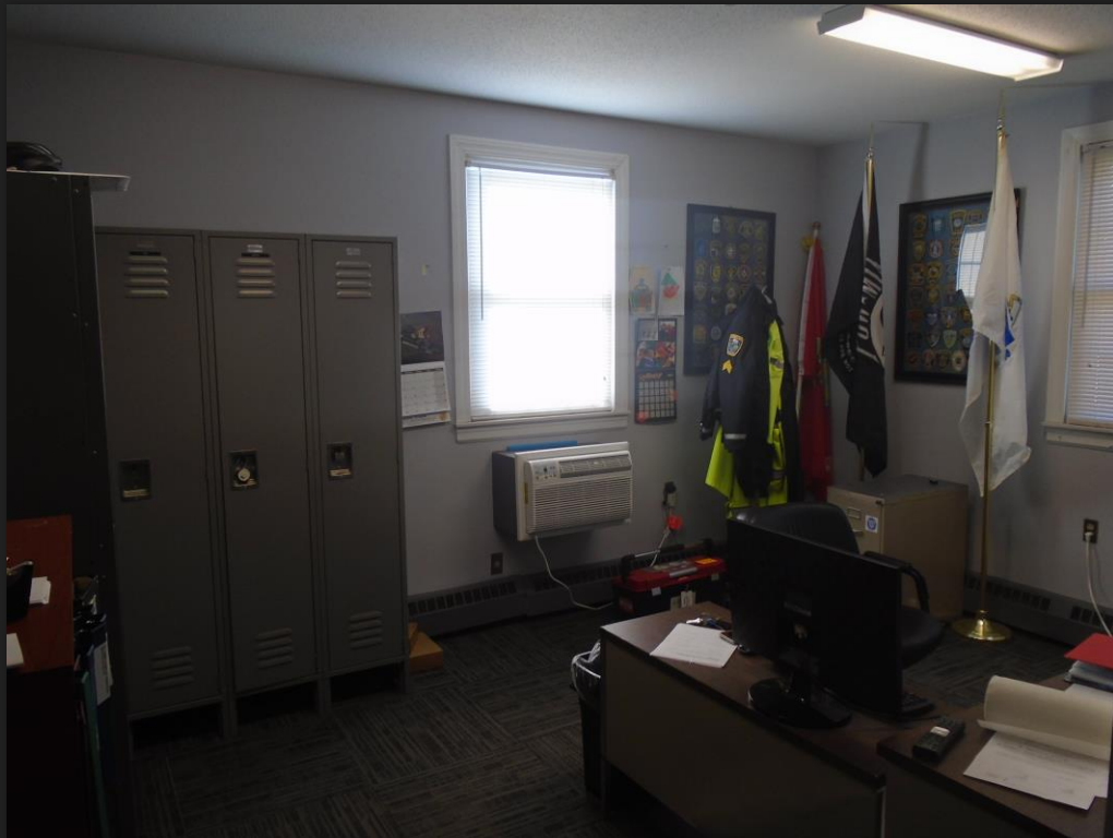
Sergeants (5) Office

The Five (5) Sergeants share a single desk and computer. Sergeant's lockers were moved due to lack of basement space. The reports writing room was the former records storage area. Work benches and stools were installed to allow for 2 work stations.