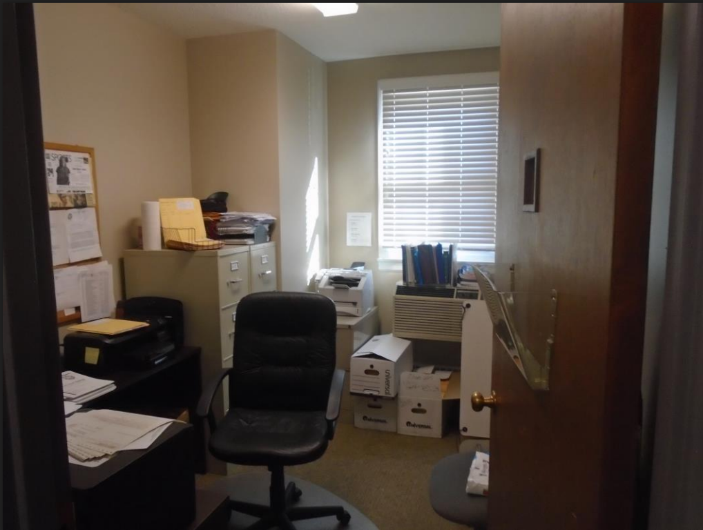
Court Prosecutor's Office

The Court Prosecutor and the Detectives use the Conference Room to interview people due to the lack of office space