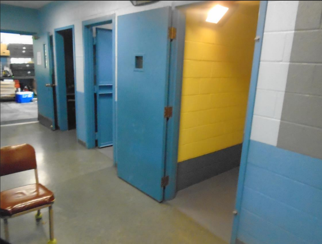
Juvenile Cell – Close Proximity to Booking

Today's standards require the juvenile cell to be out of sight and sound from adults. The photo on left shows the close proximity of the juvenile cell to booking. All toilet and sink units do not meet code.