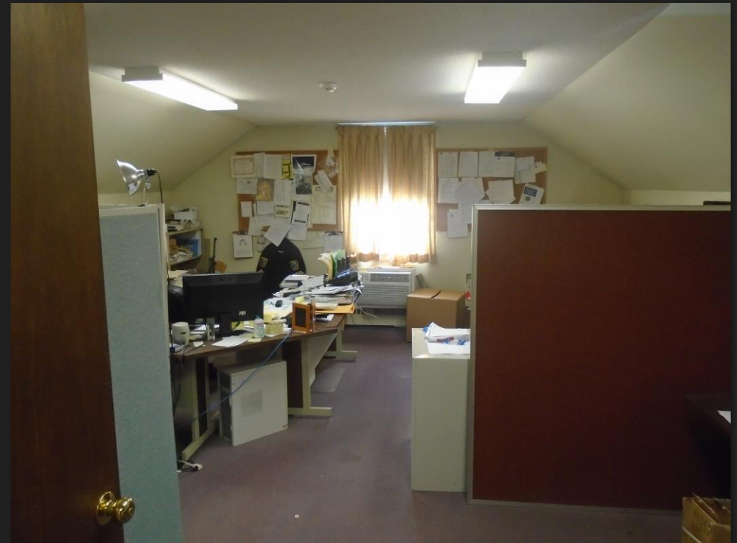
Detective's Office - Upstairs