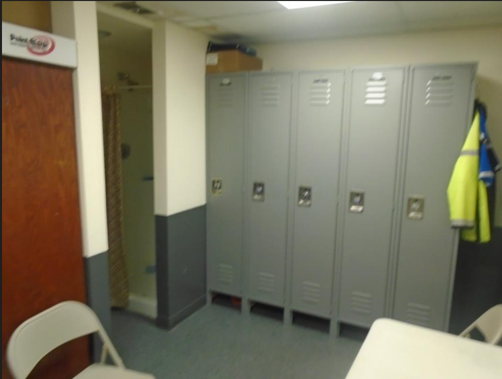
Shower is inoperable - no benches

The male locker room was added in the 1980's with some new lockers added in the past 4 years. There is not enough space for every officer to have a locker and the lockers are not sufficient to store an officer's duty gear.