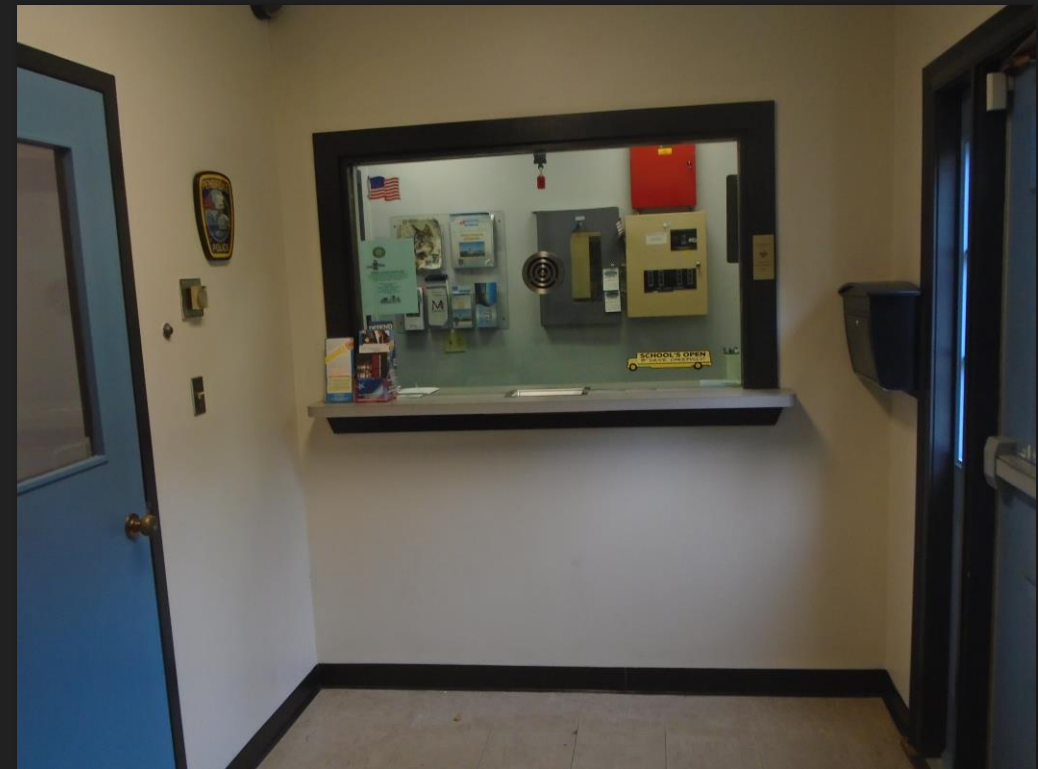
Lobby – Public Service Window