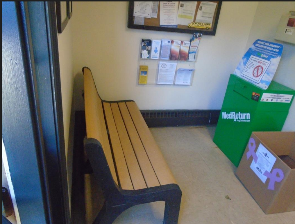
Lobby – Waiting Area and Drug Drop Off

Walk-ins, people waiting for information & reports, residents waiting to get their LTC or FID cards or to drop off unwanted prescription drugs, victims and families all share this tiny space