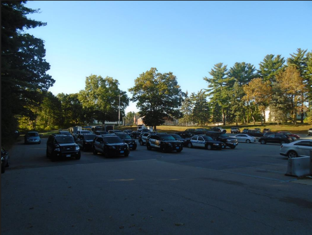
Rear Parking Lot

The rear parking lot was reconfigured to allow for 36 parking spaces. The Police Department has 27 vehicles and trailers. This does not include police employees personal vehicles. On Monday nights we often find overflow cars from Town Hall parked amongst the marked cruisers.