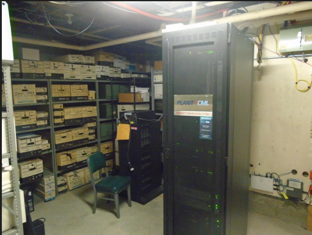
Basement - Records Storage and E-911 Server

Police Departments are responsible to maintain and store many thousands of records each year in addition to legacy records. Safekeeping personal properties requires additional space which is presently unavailable.