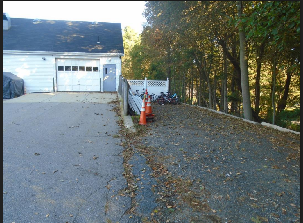
Police Impound Vehicle Storage (right)