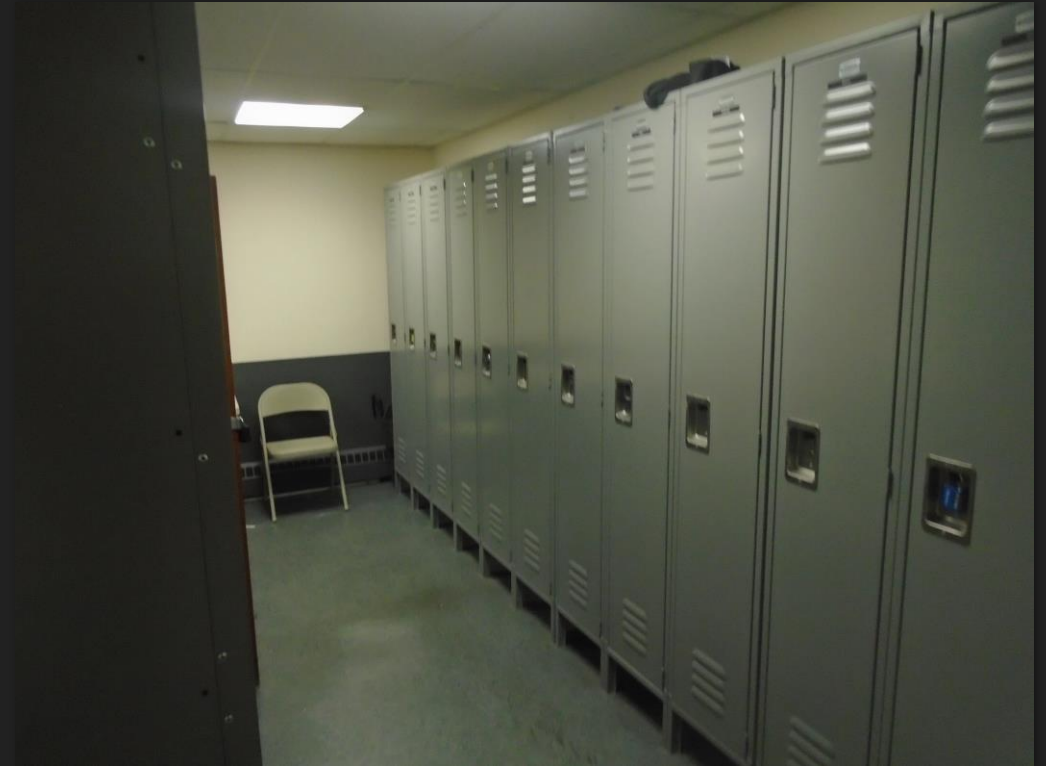
Not enough lockers for employees