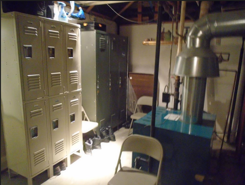
Boiler / Male Lockers and Changing Area

Several Officers have lockers in the boiler room area of the basement as shown on the left. The photo on the right shows the door that officers use to enter the basement from the rear parking lot.